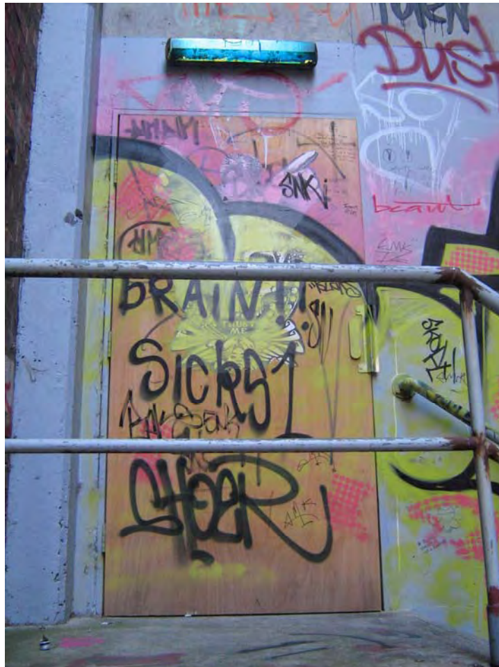
Sicks1, Lush Lane