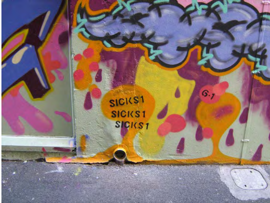
Sicks1, Union Lane