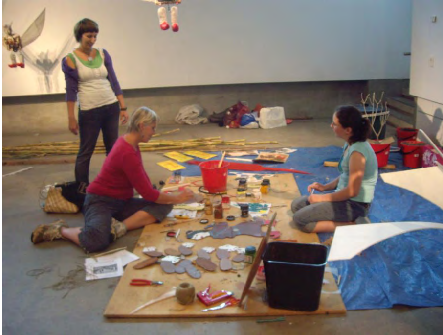
Figure 2: Artists creating The Dream Republic , 2007.

Like the initial structure of his cardboard, bamboo and string horse, Dono's collaborative arrangements were subtle and quite different from many artists such as, for example, Lee Mingwei who conventionally directs assistants, as in Gernika in Sand , at the Queensland Art Gallery (Porch 2008). Such conventional approaches to collaboration benefit students through work experience and supply the artist with free labour. Dono's methodology, however, is less defined and organically seeps into 'the practices of living' which, as Papastergiadis explains: