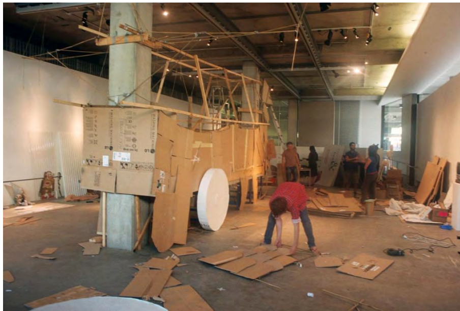
Figure 8: Trojan Horse' in construction, The Dream Republic, 2007, SASA Gallery, Adelaide.

possible through art. In this way the residency created a necessary and therapeutic space for those involved. What resulted was firstly, a fantastic if bizarre sculpture, the likes of which had never been seen in Adelaide. More important was learning how an art school might also function - as a community of interest sustained intensely, materially and voluntarily, albeit over a number of weeks. All this hinged on a temporary but structurally sturdy installation built of shoddy materials with dodgy methods where collaborators assumed ownership of a grand and crazy community project.