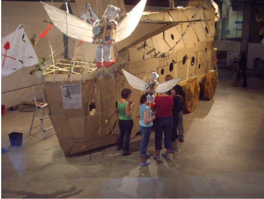
Figure 5: View from street, The Dream Republic, 2007.

What visitors to this site over six weeks witnessed was a new (or perhaps old) kind of art 'school' as groups from ceramics and textiles set up studio-based 'camps' around the installation, photographers and painters tried their hand at sculpture, and other unlikely pairs and groups worked together. Activity was organically generated between artists, art and crafts students from three local art schools as well as Dono's existing local Indonesian networks. For a time this blended community was able to dissolve disciplinary boundaries and demonstrate what an art school could be. This included the artist's advice to students to regard failure as a 'gift' (Sperou 2008).