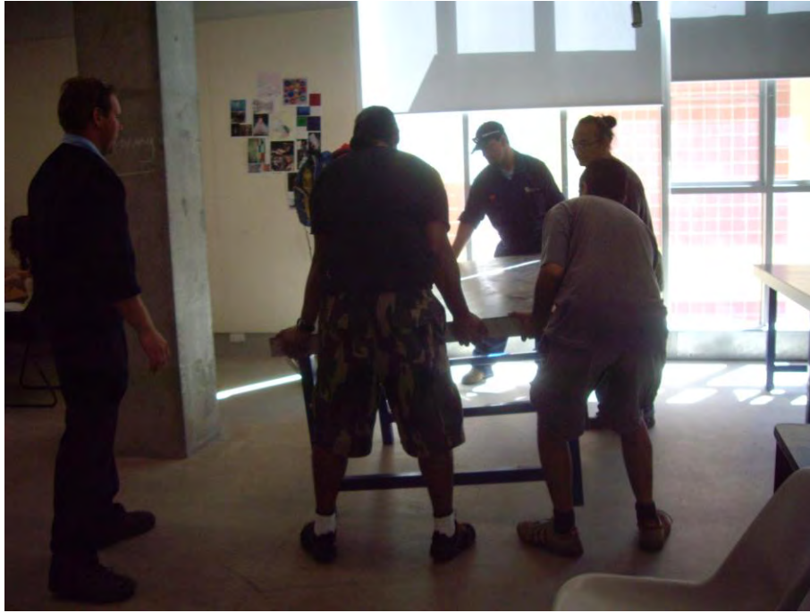
Figure 4: Moving tables for 'Trojan Horse' floor, The Dream Republic, 2007.

'Cash payments do not represent best financial practice'. Nor, apparently did the requested alternative, gold bullion. (Money was loaned from within the community and reimbursed by finance 'engineers' many months later). 'A garbage skip is forbidden in the adjacent laneway.' (Obliging employees unofficially carted rubbish across campus). And students and staff learned there was always 'another way' to get things done. At one point, an outsourced removal company staged a stand-off with University property unit staff about work practices in the gallery while everyone else worked on and ignored them – until the removalists, intrigued with the project, joined the artists! Yet amidst our constant apologies on behalf of the institution, the artist remained calm and bemused, explaining this was 'no problem, I live in Indonesia!' Apparently no-one does bureaucracy like Indonesia.