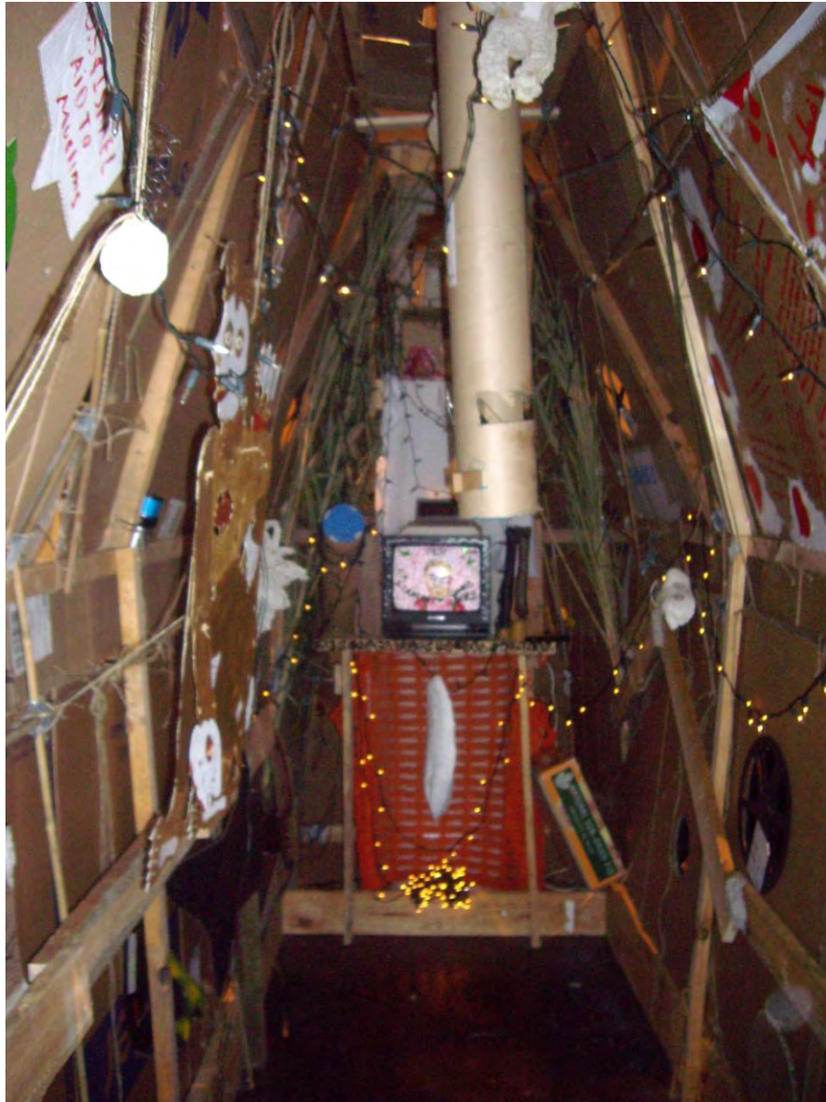
Figure 7: Interior gallery, 'Trojan Horse', The Dream Republic, 2007.

Paradoxically, the final day of the exhibition was even more exciting than the closing event of the previous evening. Demounting an exhibition with élan is rare but this final stage climaxed the entire project. At the point of demolition, while properties unit and occupational health and safety officials stood about, debating how to 'manage' the situation, the Trojan horse came down and was disposed of in less than an hour. In the frenzy of destruction around their feet and bewildered by the dynamic chaos of materials and tools flying everywhere, the forces of compliance hastily retreated.