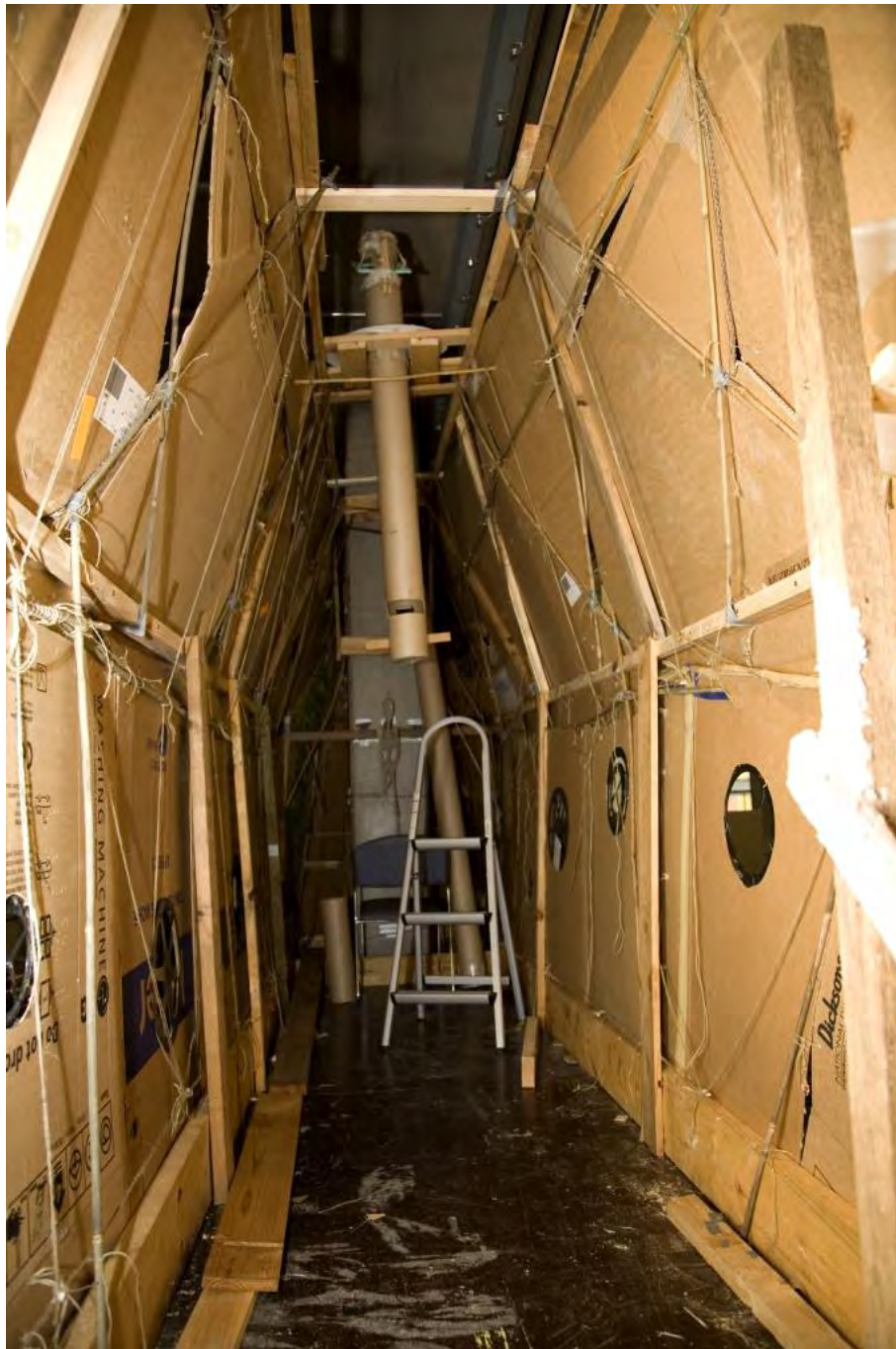
Figure 6: Interior gallery of 'Trojan Horse' (under construction), The Dream Republic, 2007, SASA Gallery, Adelaide.