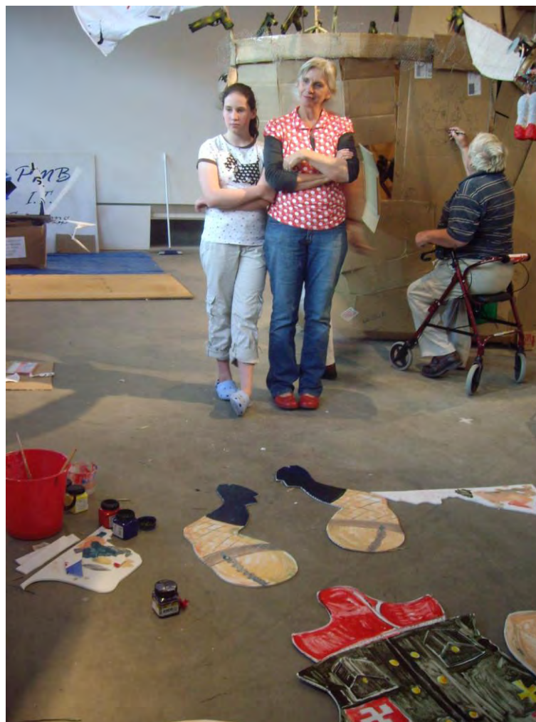
Figure 9: The Dream Republic, 2007, SASA Gallery, Adelaide.

I was truly engaged in the project as if it's part of me the whole installation sicne [sic] it allowed me to express my views and incorporate it within the project...I haven't worked on such a scale before...the whole idea of collaboration was great. I have made great friends whom [sic] made the atmosphere quite enjoyable... it was an honour to meet with Heri...I was so committed to the whole project...it was exciting, and to see people kids etc walking around the Trojan horse had made me feel proud of myself and of my efforts (El-Youssef 2007).