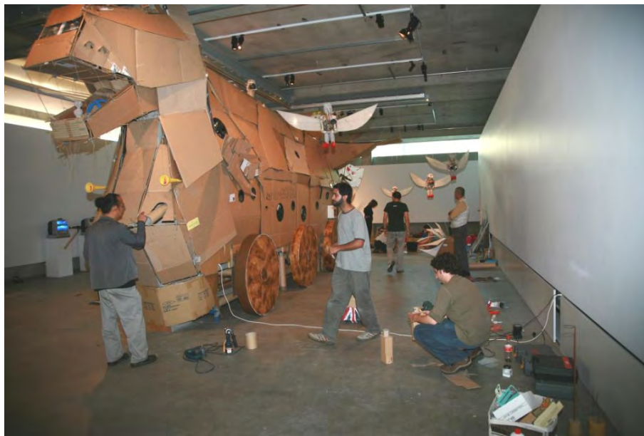
Figure 1: Heri Dono and workers: The Dream Republic, SASA Gallery, Adelaide, 2007.

environments, have been further impacted upon by corporatist university policies. It also reveals how disheartening, even harmful, situations may be effectively challenged by the resilience and creativity of visiting external artists working with students and staff. Amidst such a highly regulated environment in Adelaide a collaborative residency project was created over seven weeks by eminent Indonesian artist, Heri Dono. This took the form of an enormous Trojan horse, crammed full of work by insubordinate artists, art students and diverse members of the public. The wood, string and cardboard monster literally and figuratively entered the academy, critiqued its shortcomings and triumphed over a bulwark of Occupational Health and Safety and other bureaucratic restrictions to create an unusually healthy, holistic and optimistic environment – at least for a few weeks.