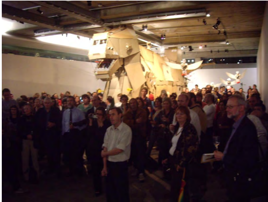
Figure 3: The Dream Republic, 2007.

'trashing' (Knights 2007) – the gallery which became an industrial work site of ever-increasing workers, visitors, mess and noise. It must be stated, however, that basic safety was maintained by Dono's organisational methodology; no-one died or was injured.