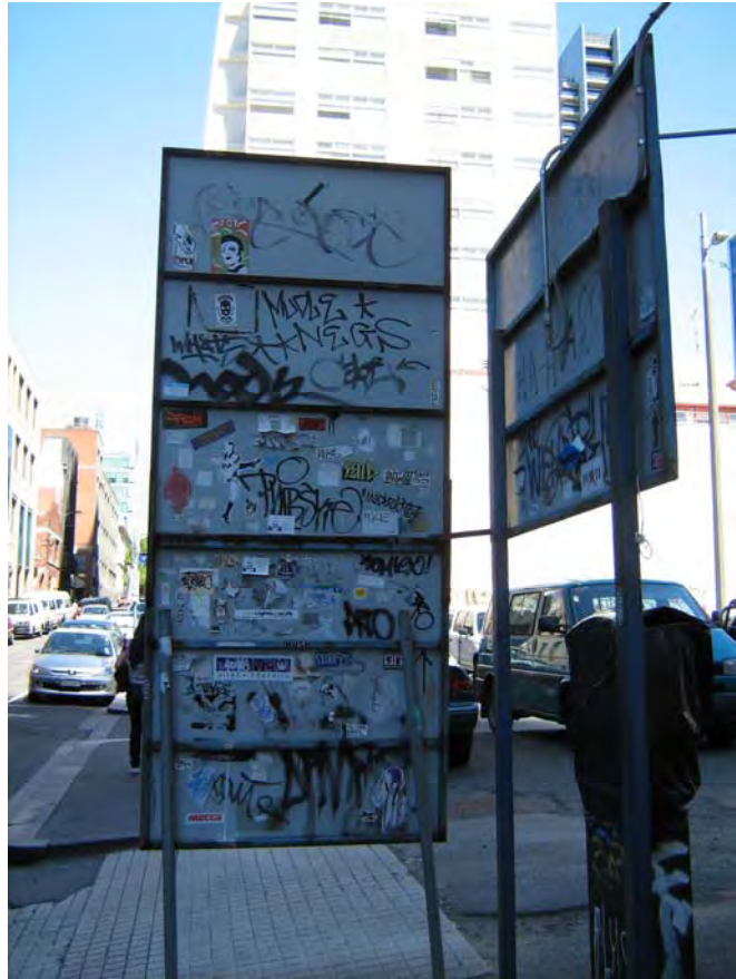
Stickers, stencils and tags

McLean Alley and Flanigan Lane: I felt malleable, yet my concentration was strangely focused. I was beginning to get tired and yet I was smiling. The layering of graffiti in this precinct was dense and complex, creating chaotic conversation. Works had been painted over with a broad brush, broken windows of a boarded up basement had been delicately tagged, stencils overlaid each other, tags and stencils reached above the second storey of buildings and down to street level, and a small landscape painting, complete with painted frame, was partly obscured by a large bubble throw up. From here I turned into Latrobe Street, saturated with the energy of the artworks and the possibility of yet another, different city.