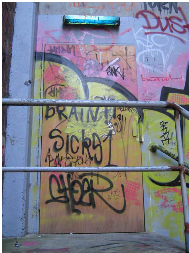
Sicks1, Lush Lane