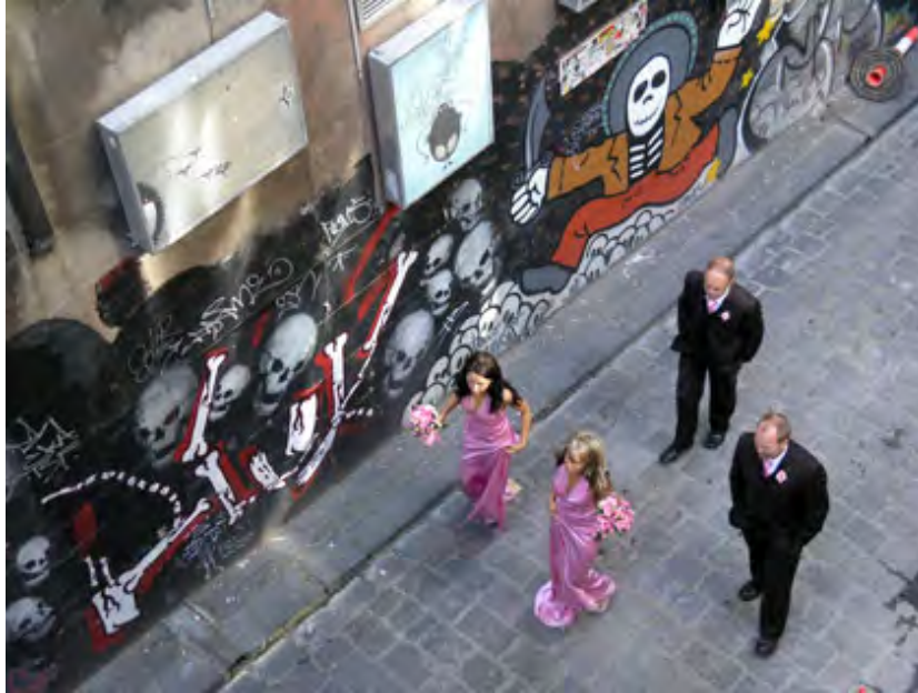
Wedding Party Hosier Lane