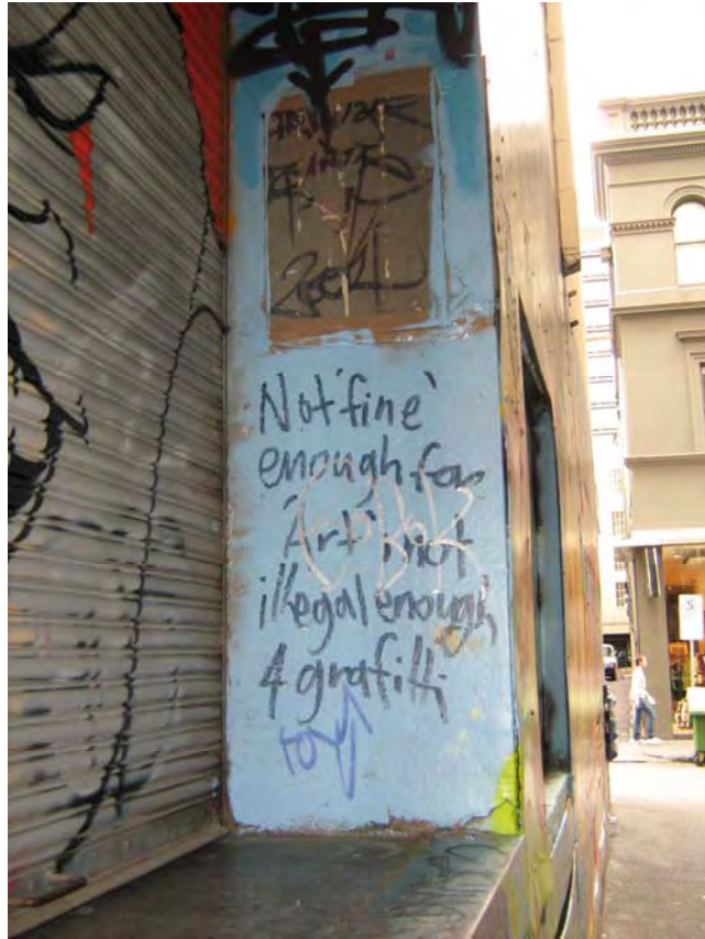
Comments in Union Lane