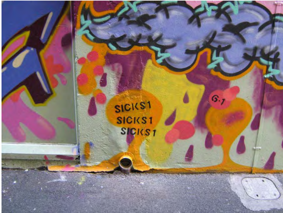
Sicks1, Union Lane