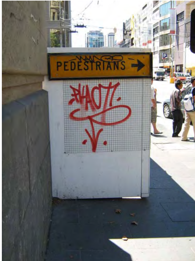
Corner Latrobe and Swanston Street